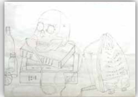
Excellence in Drawing Serene Lin