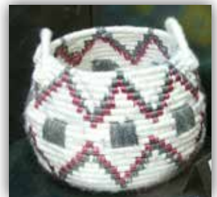
Excellence in Textiles Alassia GianCursio