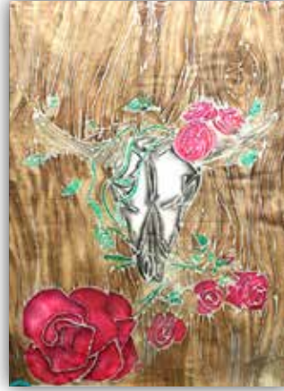
Excellence in Mixed Media Ava Kohut