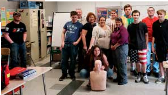
Life Skills Class